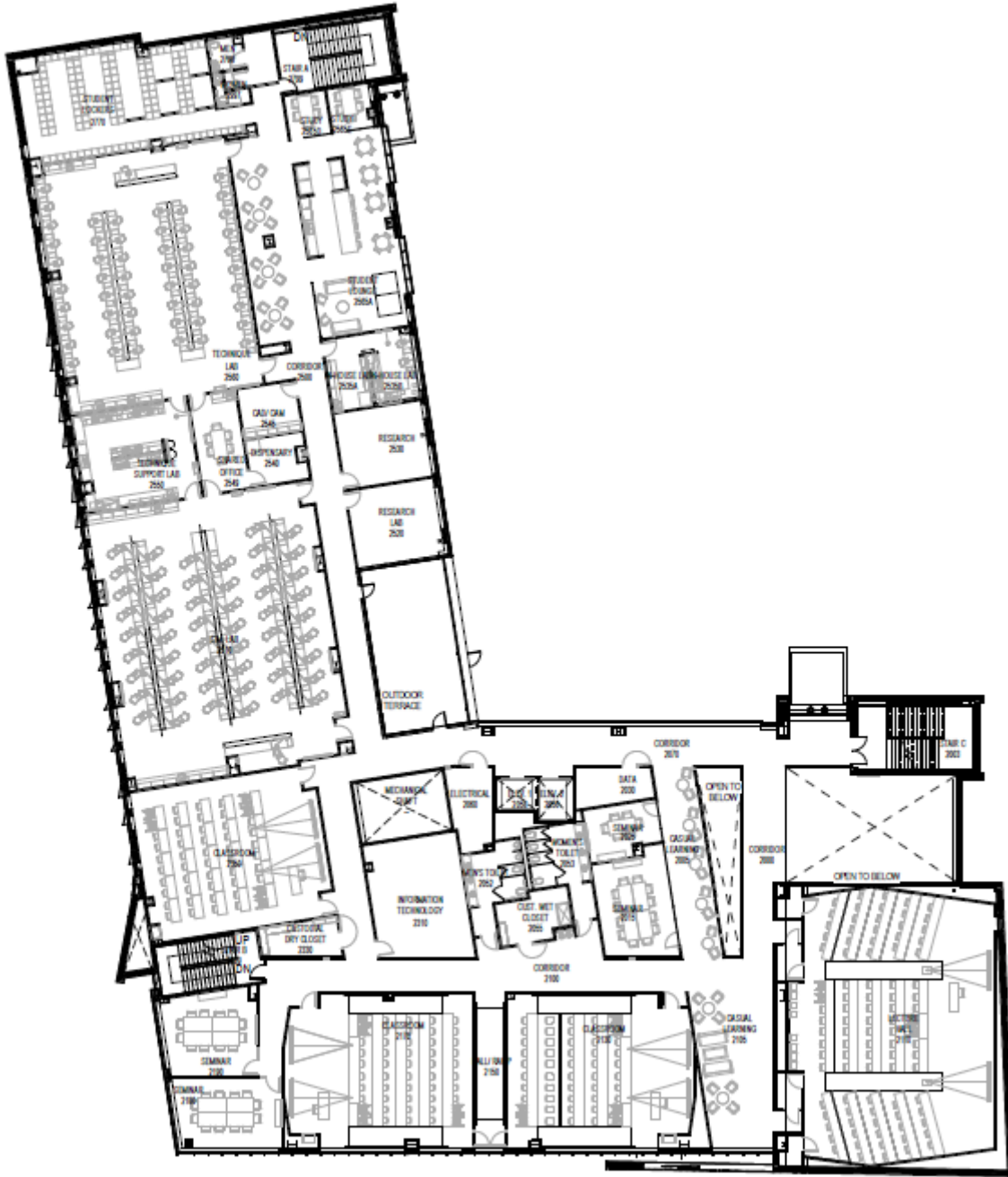
Third Floor Layout