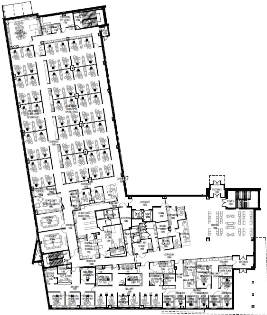
Second Floor Layout